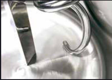
Piantone dritto Straight breaking column