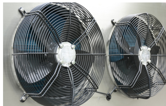
Outer heat exchanger fan