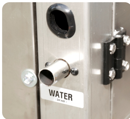
drain pipe connection