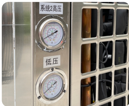
refrigerant high-pressure meter