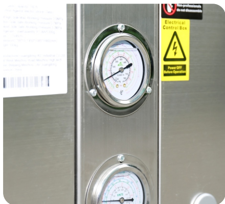
refrigerant high-pressure meter