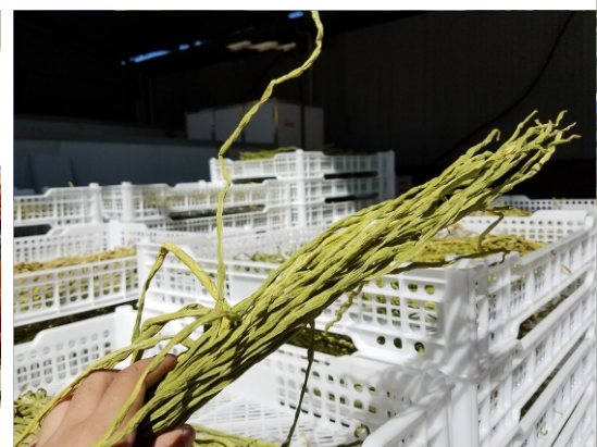
dried long bean