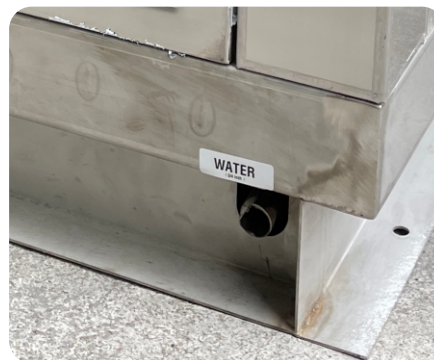
drain pipe connection